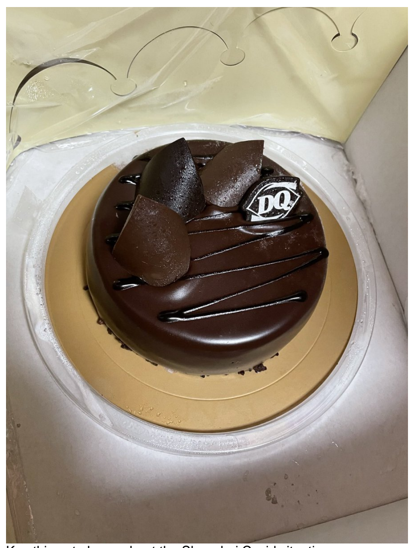
Key things to know about the Shanghai Covid situation: